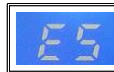
INDOOR SENSOR SHORT

(SUCH ERROR IS HAPPENED DUE TO THE FAILURE OF SENSOR SENSING UNIT; SHORT OF SENSOR EXTENSION CABLE; ELECTRIC LEAKAGE FROM THE SPOT ATTACHING SENSOR. INSPECTION IS NECESSARY AND IN CASE OF TERMINATION, RETURN AUTOMATICALLY.)