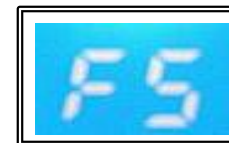
FLOOR SENSOR SHORT